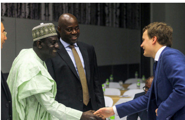
In partnership with Oyo State Nigeria, and the Russian Mission in Botswana