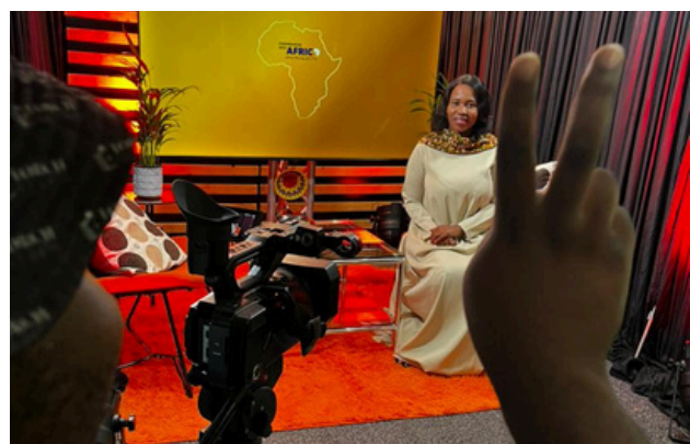
Studio Director and Presenter ,show preparations