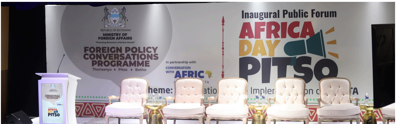
In partnership with Botswana Ministry of Foreign Affairs.