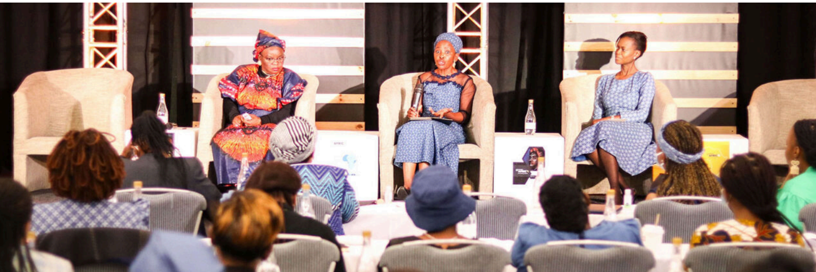
2022 CWA Pan African Women's Forum

CWA Forums are at the heart of our mission to drive action beyond dialogue. These forums are platforms for influencing policies and creating meaningful change across Africa's economic landscape. CWA brings together leaders, experts, and key stakeholders from Africa and around the world to discuss and tackle some of the most pressing challenges related to the continent's economic growth and integration. Each forum is designed to not only generate impactful discussions but to drive tangible solutions that shape Africa's economic future.