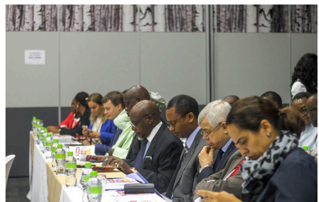
In partnership with Diverse Development Partners