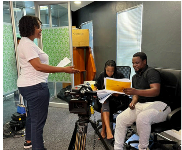
Content Producers Briefings