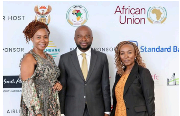
2023 AfCFTA - African Union Business Forum in RSA