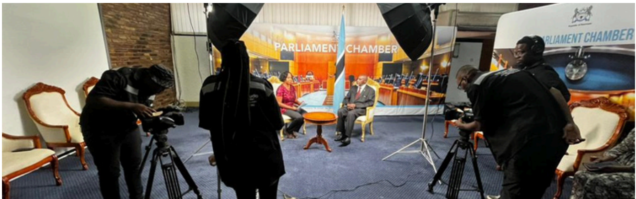
Show recording , 'Rolling'